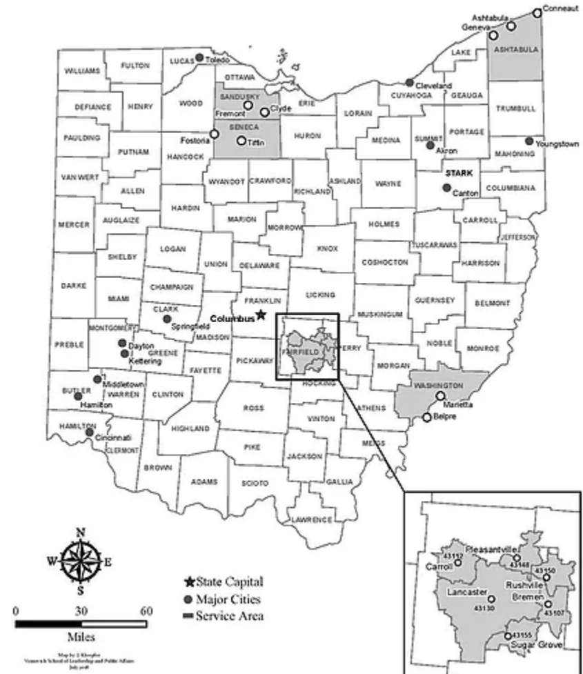
Map of Service Area Served by the Consortium